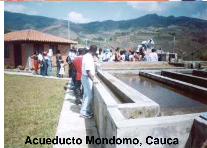
Acueducto Mondomo, Cauca